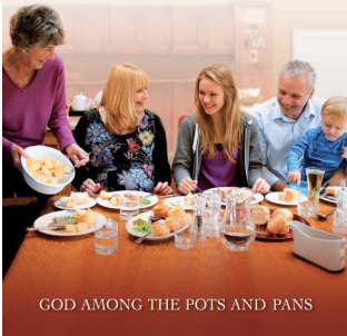
GOD AMONG THE POTS AND PANS